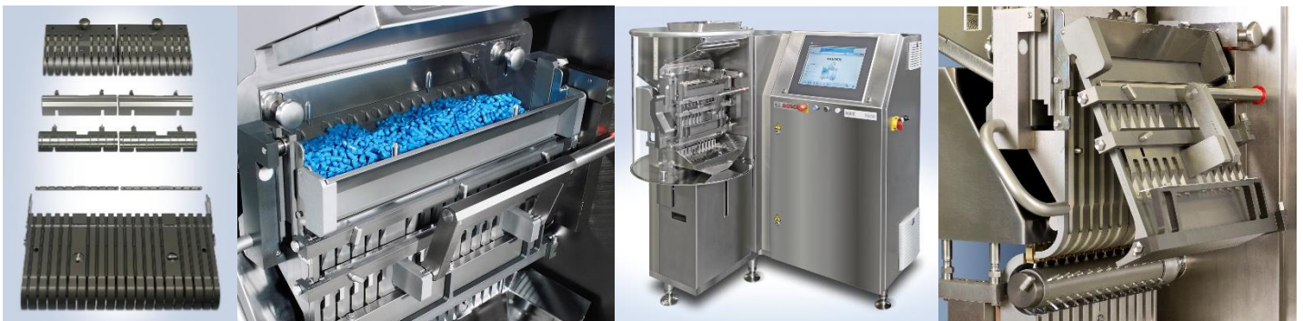
KKE Series – the ideal partner for high-precision capsule checkweighing