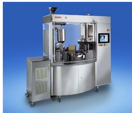
GKF 1400 L Max. 66.000 caps/h