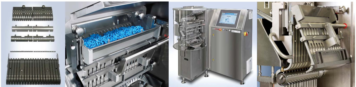
KKE Series – the ideal partner for high-precision capsule checkweighing