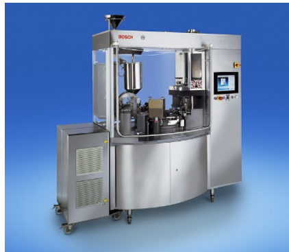
GKF 1400 L Max. 66.000 caps/h