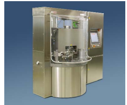
GKF 2500 L Max. 118.000 caps/h