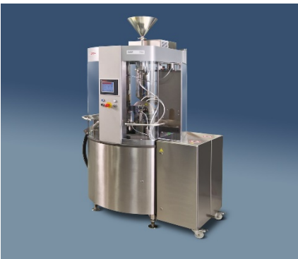
GKF 702 L Max. 33.000 caps/h